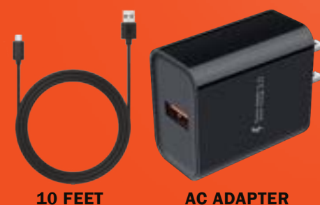
10 FEET CHARGING CORD